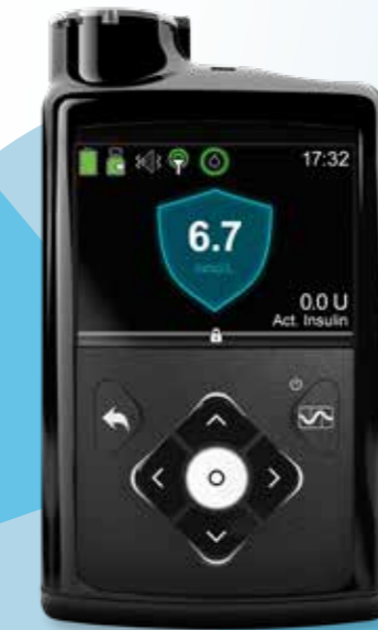
MiniMed™ 670G insulin pump

Our most accurate 5 sensor drives our exclusive SmartGuard™ technology with a smart and reliable design 6